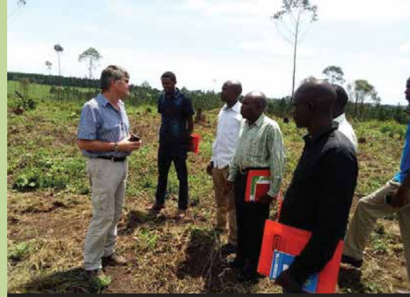
Preparations for the main assessment in Mubende Dec 2018

Six FMUs applied to be a part of the Scheme but internal assessments revealed only three FMUs were ready and were thus assessed after all their non conformances had been closed by the time of the main assessment in December 2018. These passed the main assessment and UTGA obtained the first Group Scheme Certificate for plantation forest management in Africa. UTGA is now embarking on an extension of scope to include several other FMUs on the certificate within the same resource unit and for new resource units or grower clusters.